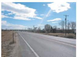
SH 85 looking South