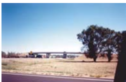
SH 16 Bridge over SH 85

If you are unable to attend this open house, there will be future opportunities to look at and comment on these proposed improvements.