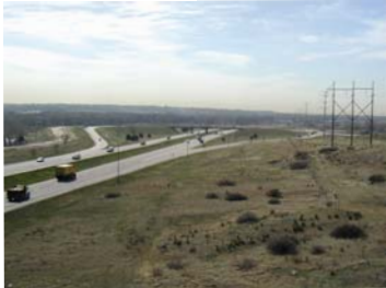
I-25/SH 16 Interchange