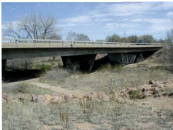
SH 16 Bridge over Crews Gulch