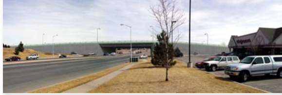
Computer simulation of Constitution, as it may look in the future

Learn More About... Our recommended improvements for Powers Boulevard What are the next steps?