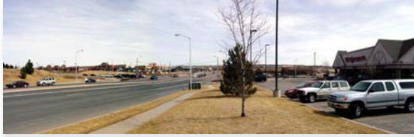
Existing: Constitution looking east