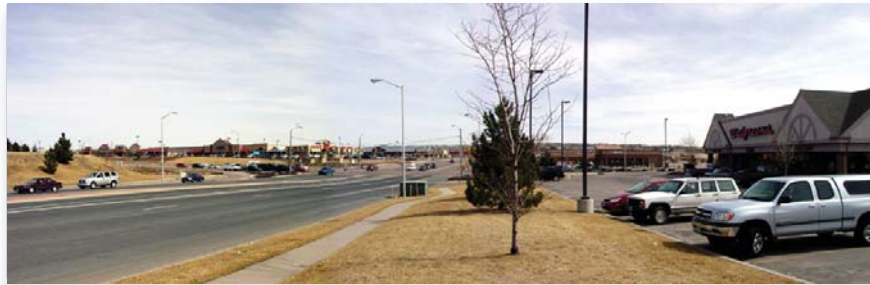
Existing: Constitution looking east