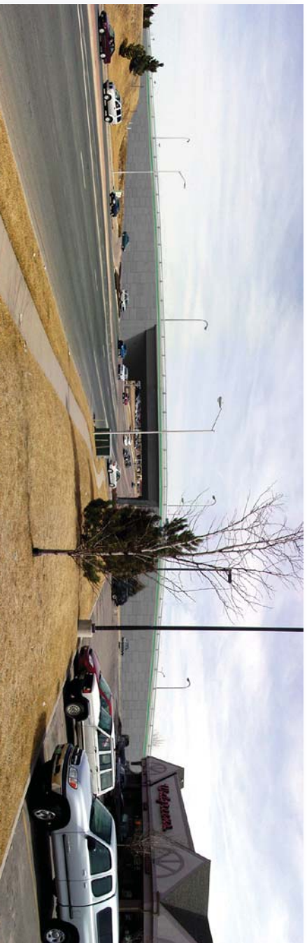
Computer simulation of Constitution looking east, as it may look in the future