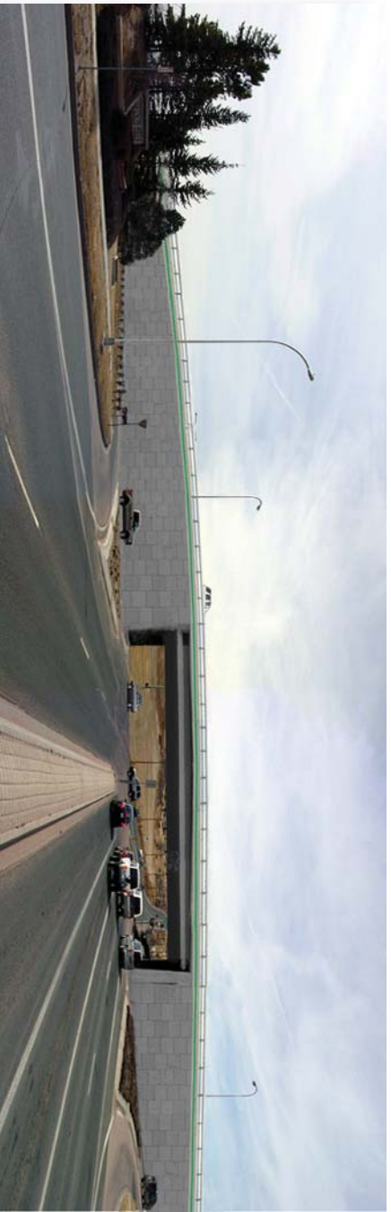
Computer simulation of Barnes looking west, as it may look in the future

Directions: Take Powers to North Carefree. Go east to Bloomington. The church is on the southeast corner of North Carefree and Bloomington.