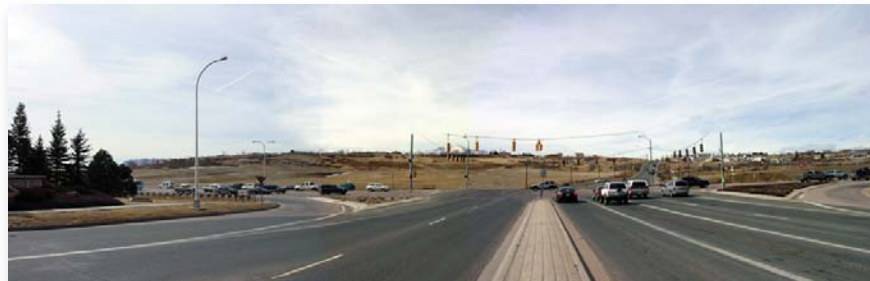
Existing: Barnes looking west